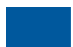
BLUE PMS 2145C