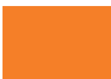
ORANGE PMS 158C