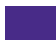
PURPLE PMS 7680C