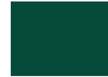
CAULFIELD GREEN PMS 350C