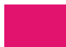
MAGENTA PMS 226C