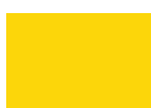
YELLOW PMS 7405C