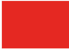
RED PMS 2035C