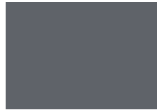
MID GREY PMS Cool Grey 9C