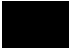
Black PMS Black C